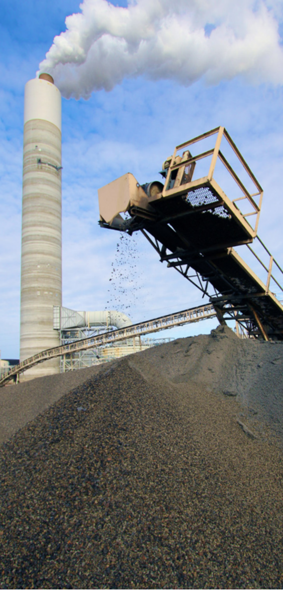
Although America currently recycles about 40 percent of the coal ash produced annually, that leaves tens of millions of tons of material that still must be disposed.