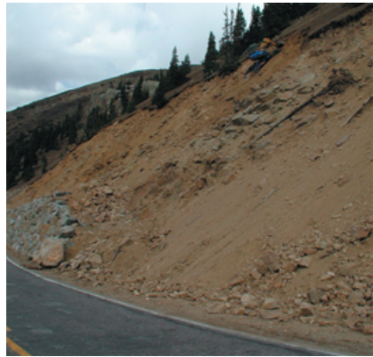
Pre-construction slope stabilization

Mechanically stabilized earth walls may be concrete, albeit in smaller doses. Instead of a large pour of liquid concrete that needs to cure, MSE systems are already "pre-cured" and ready to set up. The likely ancestors of these systems—dry-set or mortared stone walls—long ago served erosion control purposes, but their components were of inconsistent size and volume, they were very labor-intensive, and they were ineffective or useless after a certain height was attained.