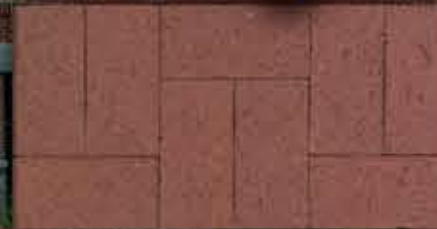
Pathway Red 2 1/4" x 4" x 8" (Modular available)