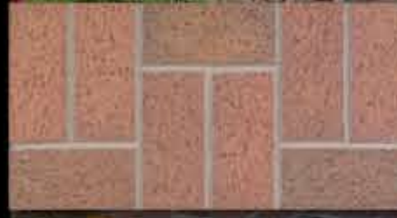
Carytown FR 1 3/8" Modular