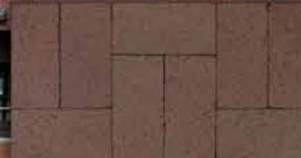
Cocoa 2 1/4" x 4" x 8"