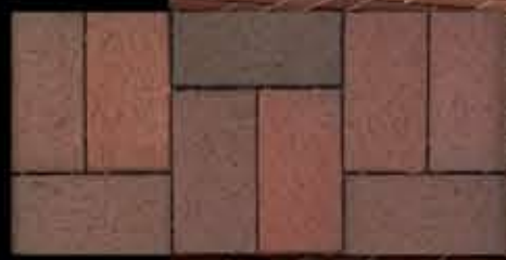
English Edge® Autumn