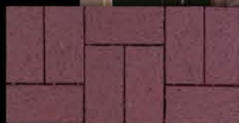
English Edge® Ironspot