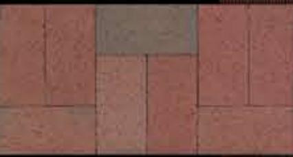
Pathway FR 2 1/4" x 4" x 8"