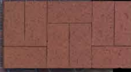
Brookstown Red 1 3/8" x 4" x 8" (Modular available)