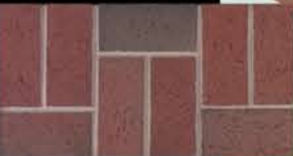
Pathway FR 2 1/4" Modular