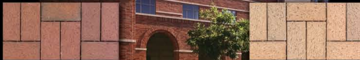
English Edge® Rose FR English Edge® Buff