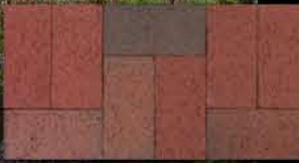
Brookstown FR 1 3/8" x 4" x 8" (Modular available)