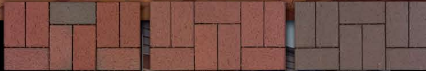
English Edge® FR English Edge® Red English Edge® Dark Accent

English Edge® 2 1/4" is the original clay paver with spacer nibs and bevels on both bed surfaces. Available in 2 1/4" x 4" x 8" (2 3/4" for heavy vehicular applications.)