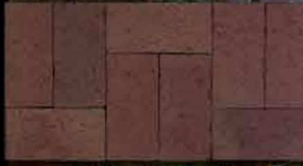
Harbourtown FR 1 3/8" x 4" x 8" (Modular available)