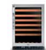
15" & 24" Wide Wine Cellars and Refrigerated Beverage Centers (custom front models available)

centers, refrigerated drawers, and the ice machine keep your favorite refreshments at the ready and deliver