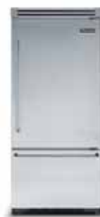
36" Wide Built-in, Bottom-Mount Refrigerator/Freezer