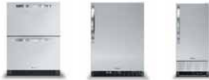
24" Wide Refrigerated Drawers (custom front model available) 24" Wide Refrigerated Beverage Center with Icemaker (custom front model available) 15" Wide Ice Machine (custom front model available)

in cold storage, all-refrigerator and all-freezer units couple