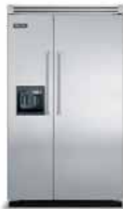
42" & 48" Wide Built-in, Side-by-Side Refrigerator/Freezers (non-dispenser models available)

ingredients? With incredible storage space