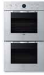
Electric 27" & 30" Wide Double Ovens