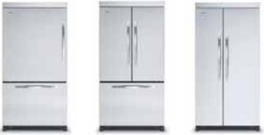
36" Wide Freestanding Bottom-Mount Refrigerator/Freezer* 36" Wide Freestanding French-Door Bottom-Mount Refrigerator/Freezer* 36" Wide Freestanding Side-by-Side Refrigerator/Freezer* (dispenser model available)

in cold storage, all-refrigerator and all-freezer units couple