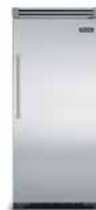
30" & 36" Wide Built-in All-Freezers

and exceptional features, Viking built-in refrigerator/freezers offer the ultimate in cold storage. Side-by-side and bottom-