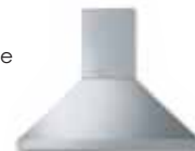
30", 33", 36", 39", 42", 45", 48", & 51" Wide Wall Hoods

And a variety of ventilation systems complement the Designer Series in form and function.