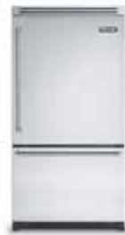
36" Wide Freestanding, Bottom-Mount Refrigerator/Freezer*