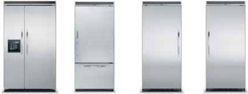
42" & 48" Wide Built-in, Side-by-Side Refrigerator/Freezers (custom front and non-dispenser models available) 36" Wide Built-in, Bottom-Mount Refrigerator/Freezer (custom front model available) 30" & 36" Wide Built-in All-Refrigerators (custom front models available) 30" & 36" Wide Built-in All-Freezers (custom front models available)

stunning. Built-in refrigerator/freezers are available in either side-by-side or bottom mount models. And for the ultimate