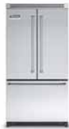
36" Wide Freestanding, French-Door Bottom-Mount Refrigerator/Freezer*