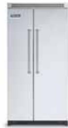
36" Wide Freestanding, Side-by-Side Refrigerator/Freezer* (dispenser model available)