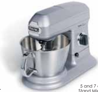
5 and 7 qt. Stand Mixers

Exclusive stainless steel V beater, whip, dough hook, and ergonomic bowl all come standard.