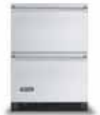
24" Wide Refrigerated Drawers

French-door bottom-mount – Energy Star qualification and frost-free professional features are a given.