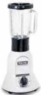
40 oz. Blender

clean. Available in two-slot and four-slot models. The professional blender is built to become an