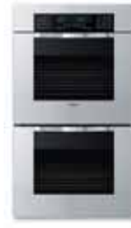
Electric 27" & 30" Wide Touch Control Ovens