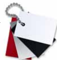
White Black Stainless Gray Bright Red

come. Good thing the four available color finishes will never go out of style.