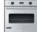
Electric 27", 30", & 36" Wide Single & Double Ovens