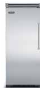
30" & 36" Wide Built-in All-Refrigerators